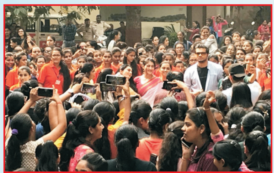
ROAD SAFETY WEEK CELEBRATION

Celebration with the co-star and director of first award winning Guajarati film "Hellaro"