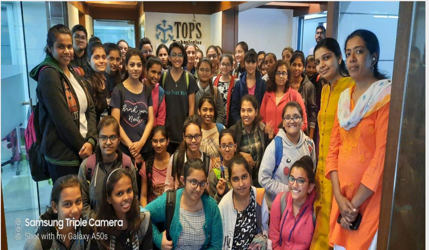
Industrial Visit at Tops Technologies