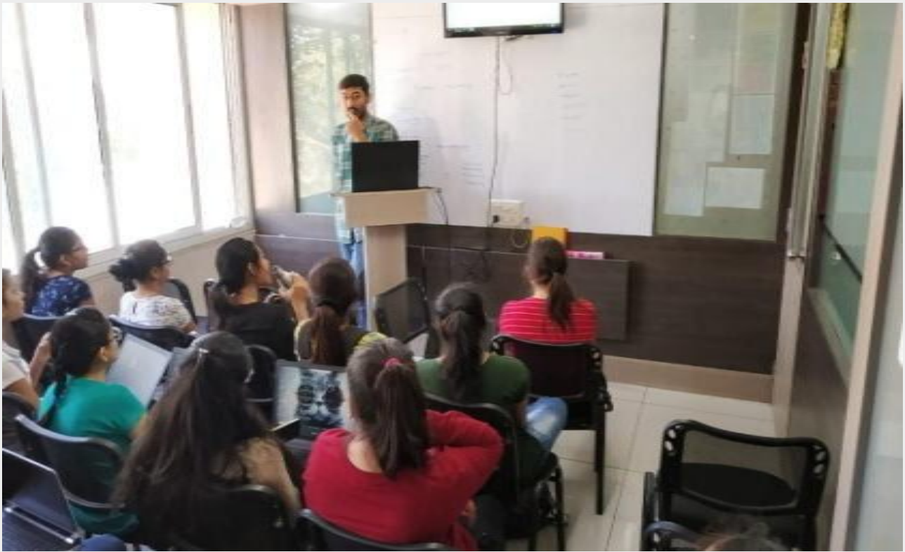
Industrial Visit at CreArt Solution