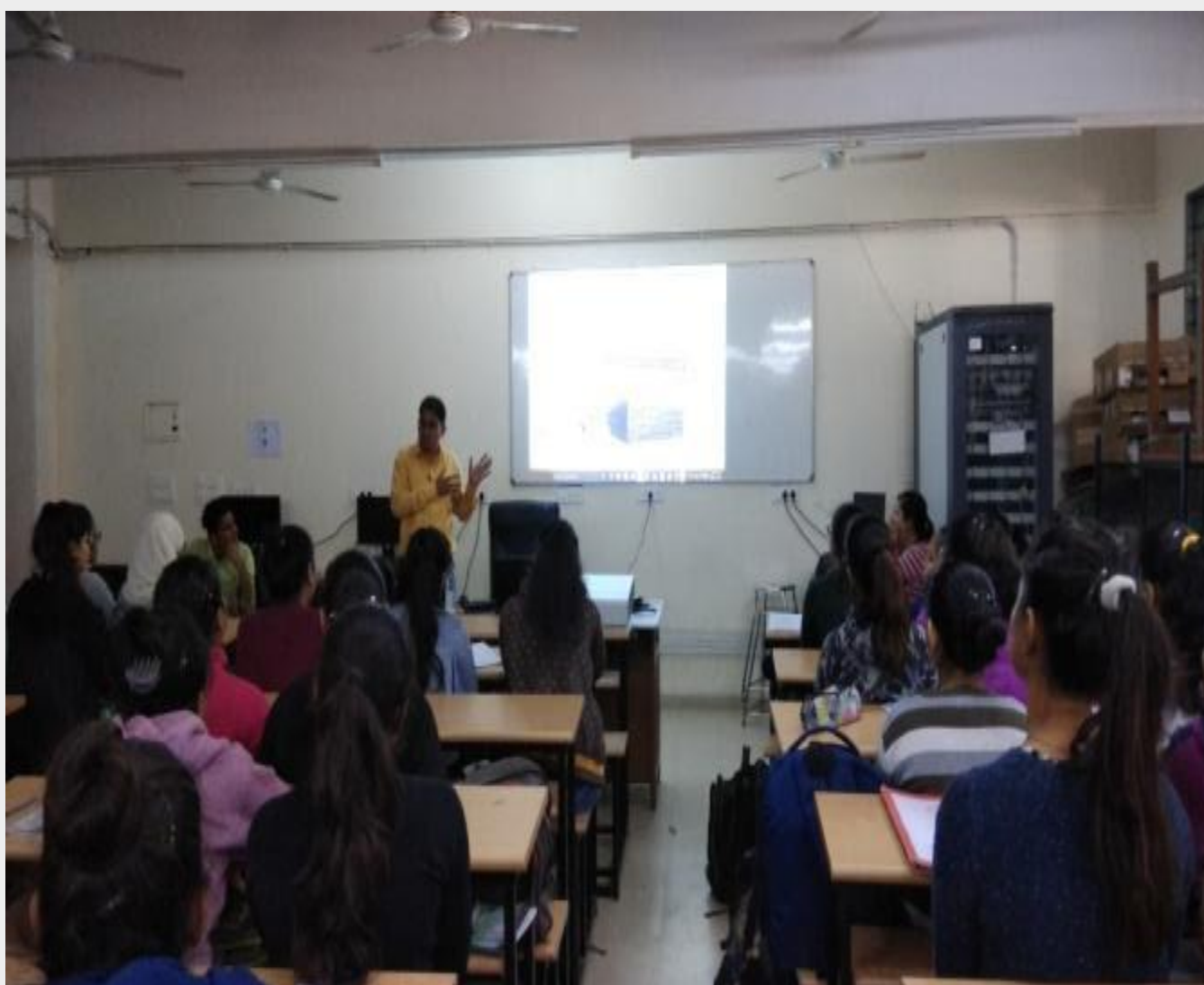
Seminar On Networking