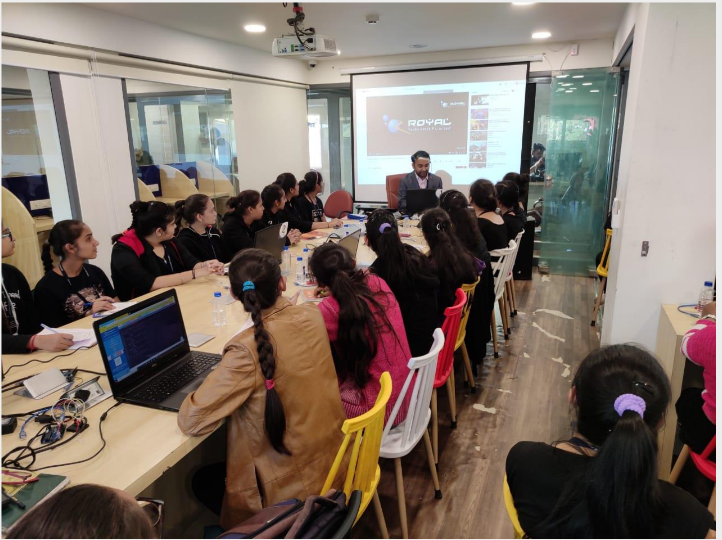
Industrial Visit at Royal technosoft