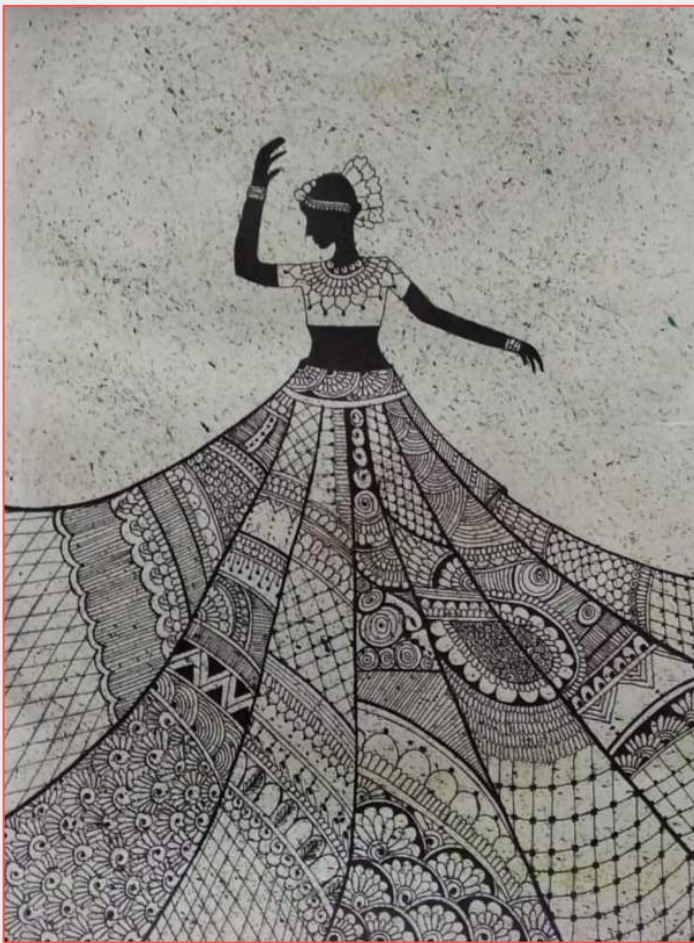
Doodle Art by Helly Chauhan(3 rd Sem)