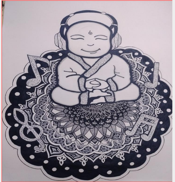
Drawing by Parita B. Thakkar(3 rd Sem)