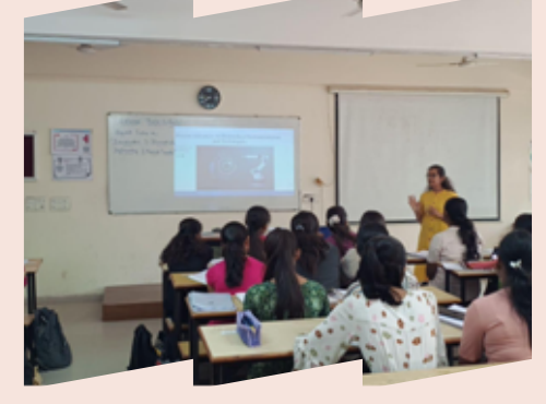
EXPERT LECTURE ON RECENT TRENDS BY MS. POOJA GOHEL FROM L.D. COLLEGE OF ENGG., ATTENDED BY 30 STUDENTS.