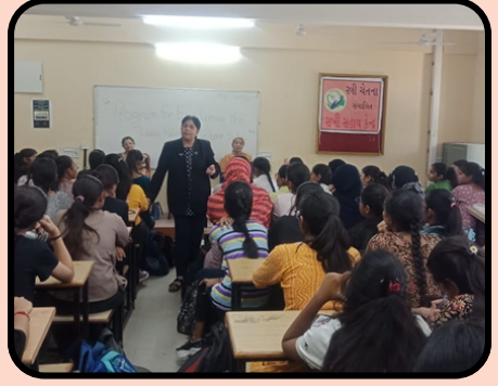
Program for Explaining the Laws related to Women's safety