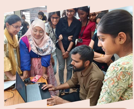
A WORKSHOP ON MICROCONTROLLERS AND AUTOMATION WAS CONDUCTED BY XYZ, WITH 55 STUDENT PARTICIPANTS.