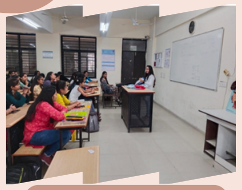
EXPERT LECTURE ON INTERNAL SURGICAL STAPLERS BY MS. JHANVI GAJJAR FROM PANTHER HEALTHCARE, ATTENDED BY 76 STUDENTS.