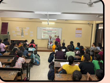
Expert lecture on "Women's health issues, Menstrual cycle and diet" for Girls students