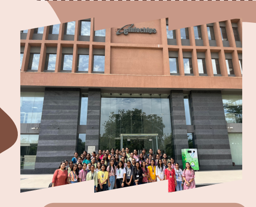
VISIT TO EINFOCHIPS BY THE COMPUTER DEPARTMENT WITH 3RD AND 5TH SEMESTER STUDENTS.