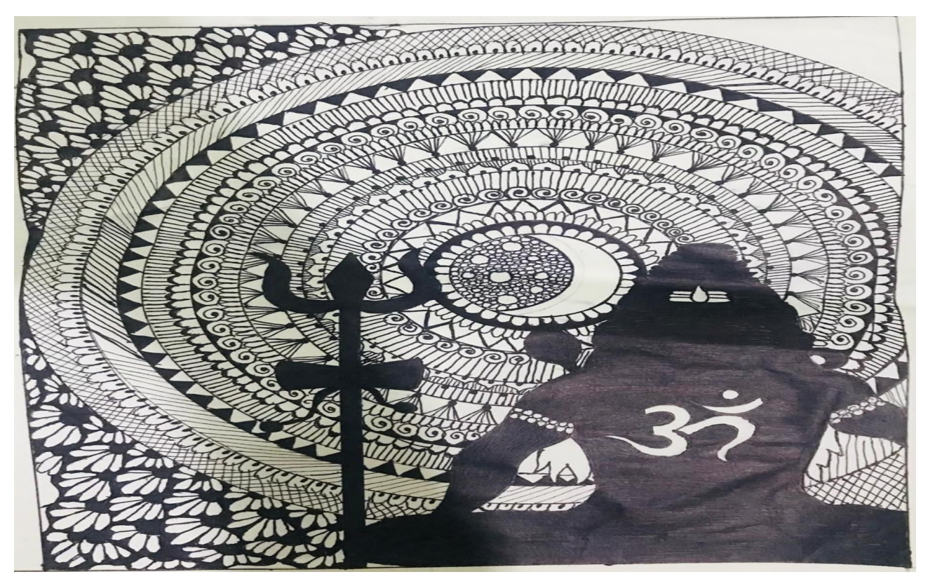
Rathi Divya, Sem 2