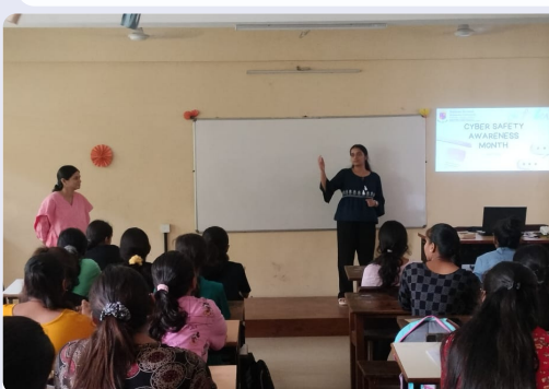
Cyber Security Awareness