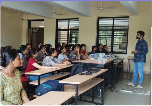
Hands-on Session on Android