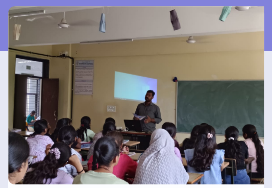
Expert lect on Networking