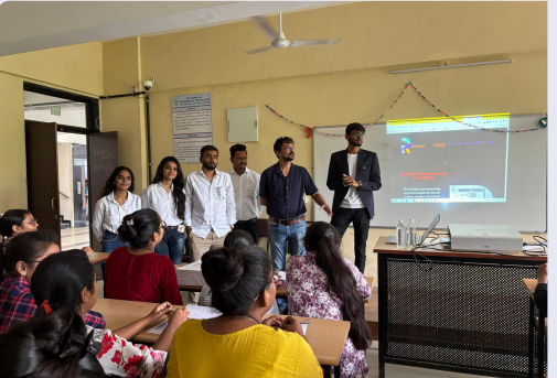
Cyber Security Training