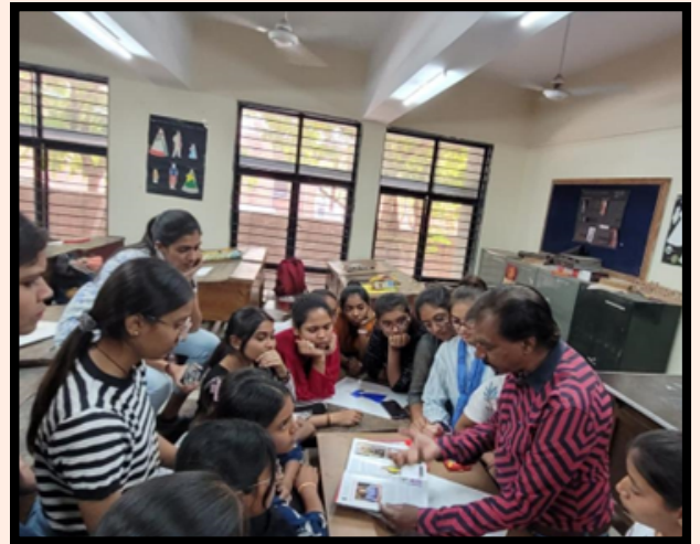
RENDERING TECHNIQUES - 09/04/24