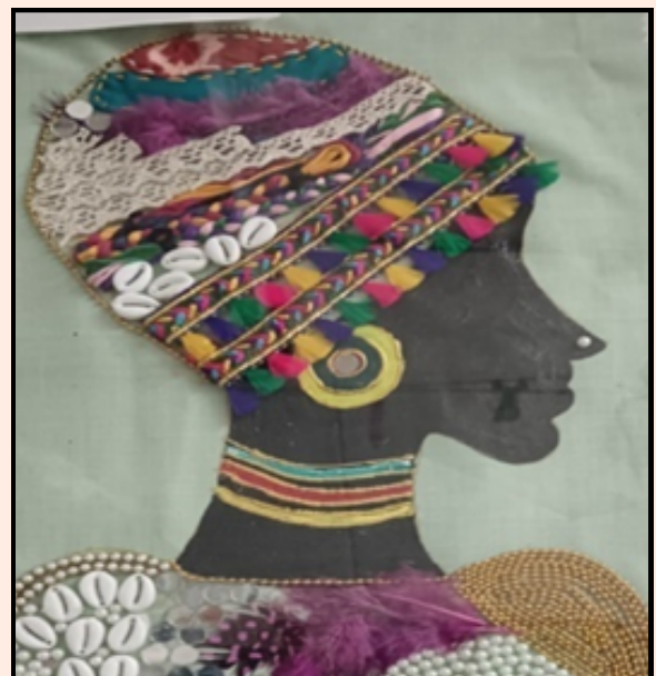
"ART IS A WOUND TURNED INTO LIGHT." - GEORGES BRAQUE