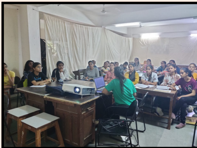
WORKSHOP IN BASIC AUTOCAD