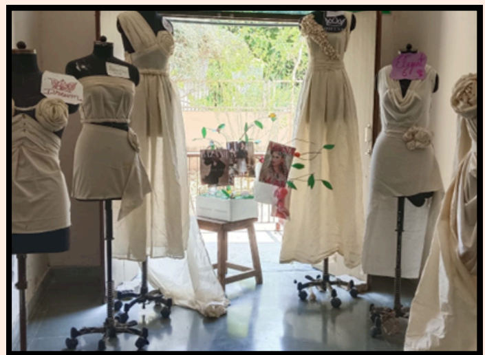
DISPLAY OF TECHNICAL EVENT - KNOT & FLOW

YOU NEVER STOP LEARNING. IF YOU HAVE A TEACHER, YOU NEVER STOP BEING A STUDENT. -ELISABETH ROHM