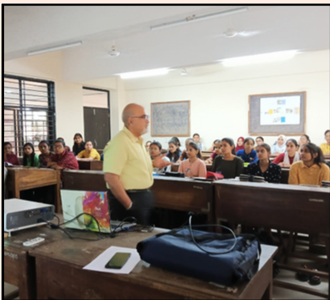
FASHION COMMUNICATION 20-03-2024