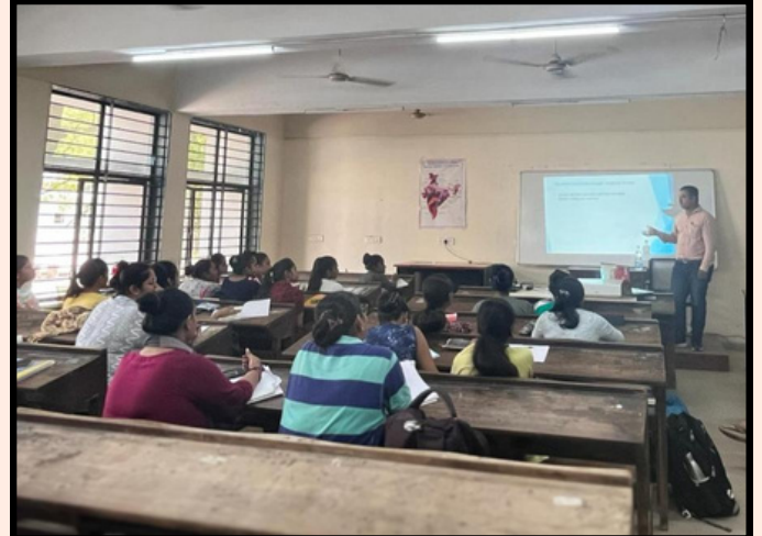
TECHNICAL TEXTILE 19-04-2024