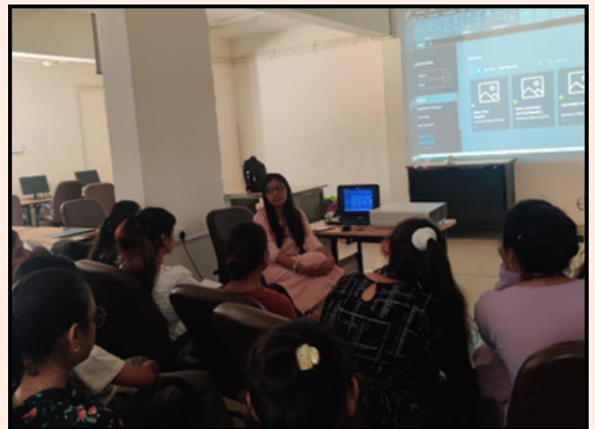
ADVANCE AUTOCAD 21-03-24