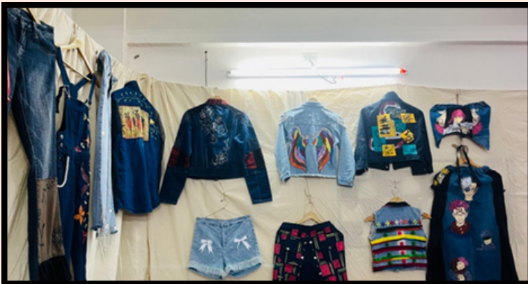
FASHION SHOW- ABHVIYAKTI-2024 16/04/2024