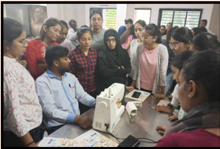
DEMONSTRATION OF LATEST SEWING MACHINE

These sessions provided students with valuable practical experience and exposure to industry expertise.