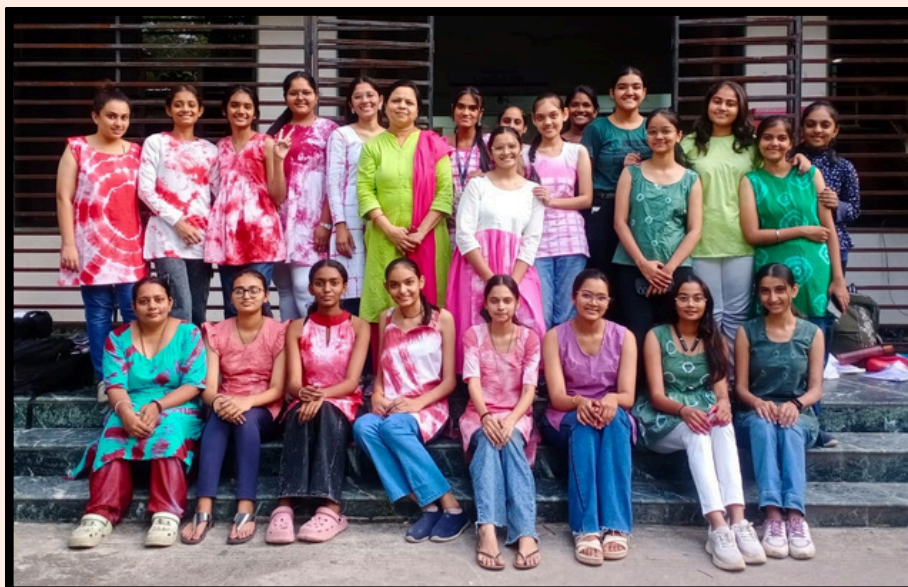
TIE-DYE FRENZY: 3RD SEMESTER STUDENTS UNLEASH THEIR CREATIVITY