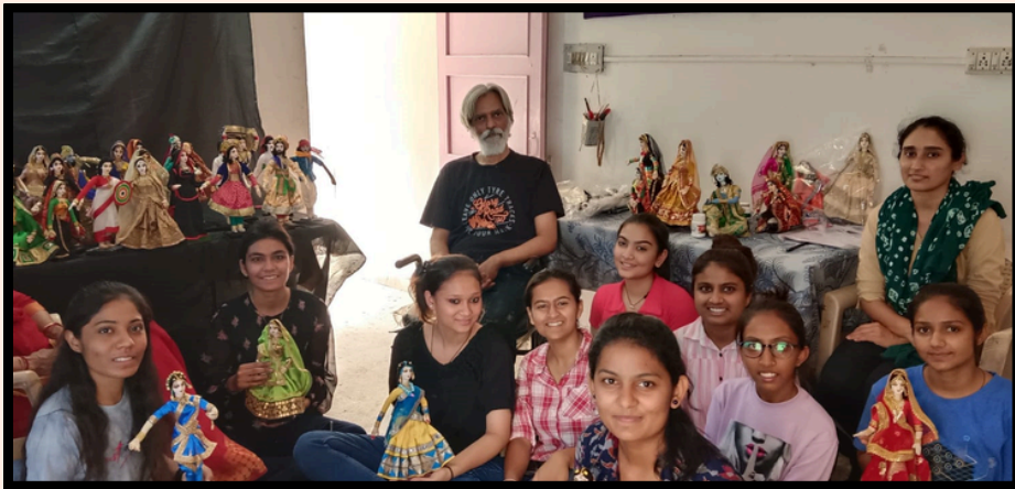
Students visited Kalashree doll museum-Gandhinagar related to ITC subject

These visits not only enhanced our students' theoretical knowledge but also equipped them with practical skills and industry insights.