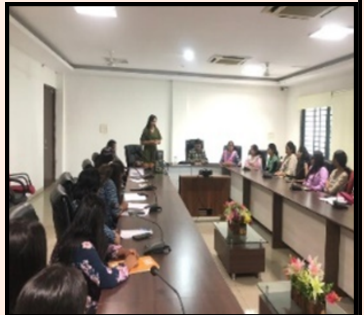
VISIT TO CED CAMPUS AND EXPERTS TALK ON ENTREPRENRSHIP AT G.I.D.C, NARODA,

This visit was specifically designed to align with the syllabus of subject code 3365102, Entrepreneurship Development, under the Industrial Management and Entrepreneurship module. The trip offered our students a comprehensive understanding of the subject matter, bridging the gap between theoretical knowledge and practical application.