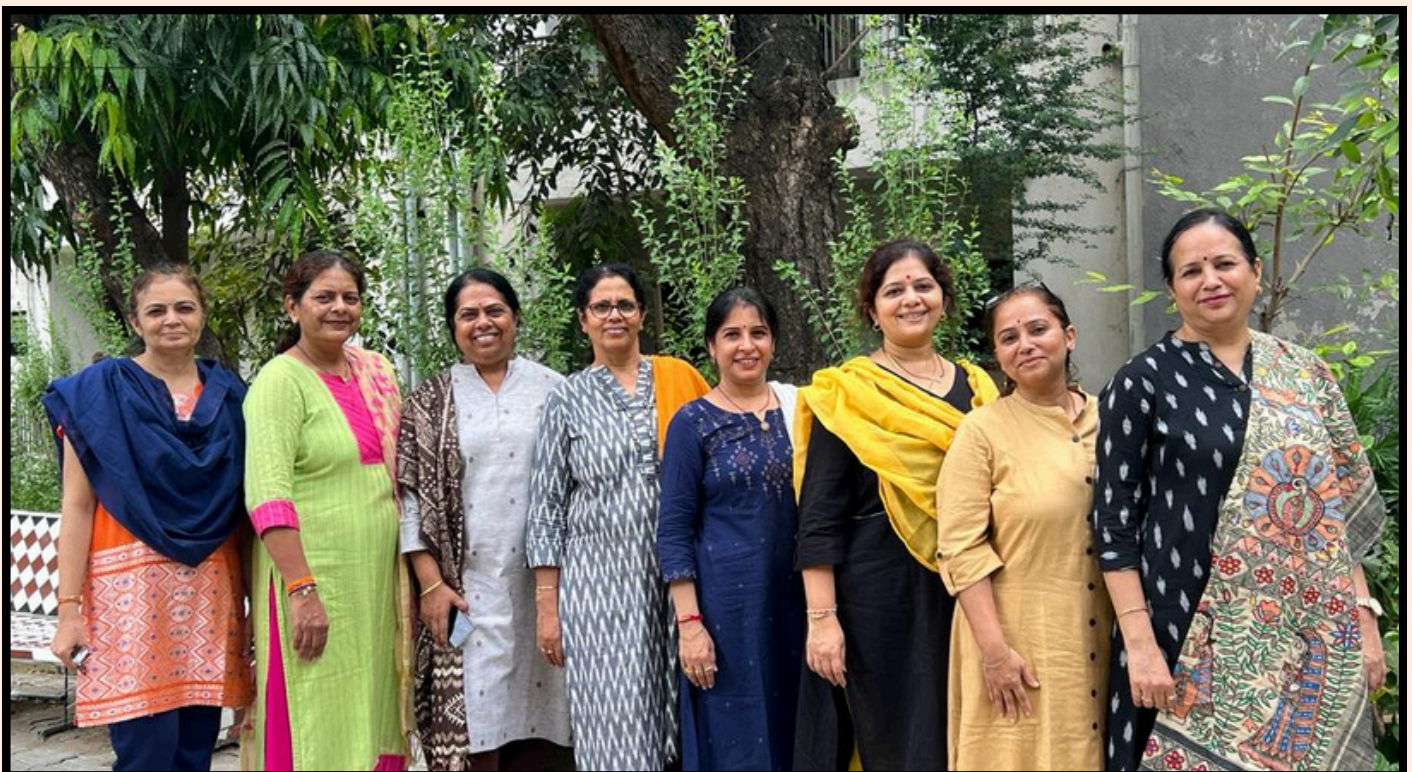
FACULTY CELEBRATING NATIONAL TEXTILE DAY-03 MAY,2023