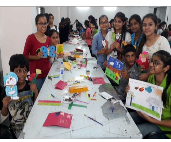
Let's Spread Happiness